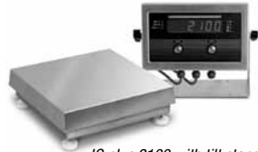
IQ plus 2100 with tilt stand