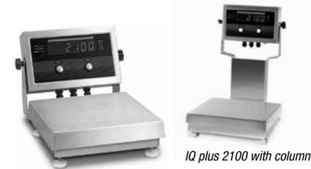
IQ plus 2100 with attachment bracket