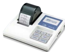
AD-8121B Dot Matrix Compact Printer