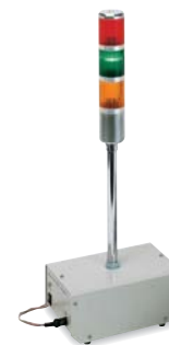
AD-8951 Comparator Light