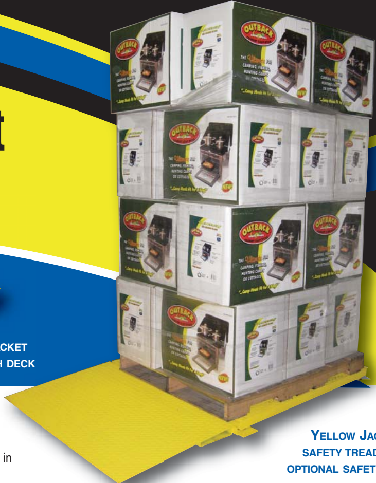
YELLOW JACKET WITH SAFETY TREAD DECK AND OPTIONAL SAFETY TREAD RAMP

The Yellow Jacket Floor Scale is finished with a safety yellow powder coat paint that is easy for forklift operators to see, even in low-light warehouse environments. The scale is constructed of durable Type A36 carbon steel and has a unique multi-ribbed understructure support design, made to provide years of uninterrupted and accurate performance.