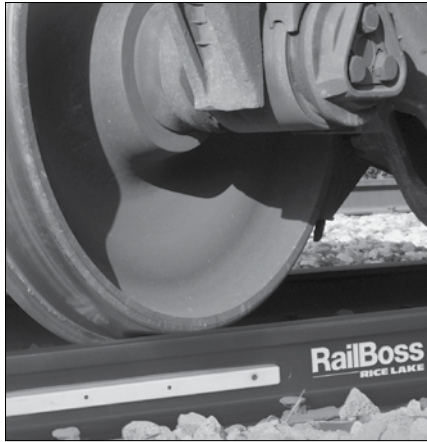
* Non Legal-For-Trade